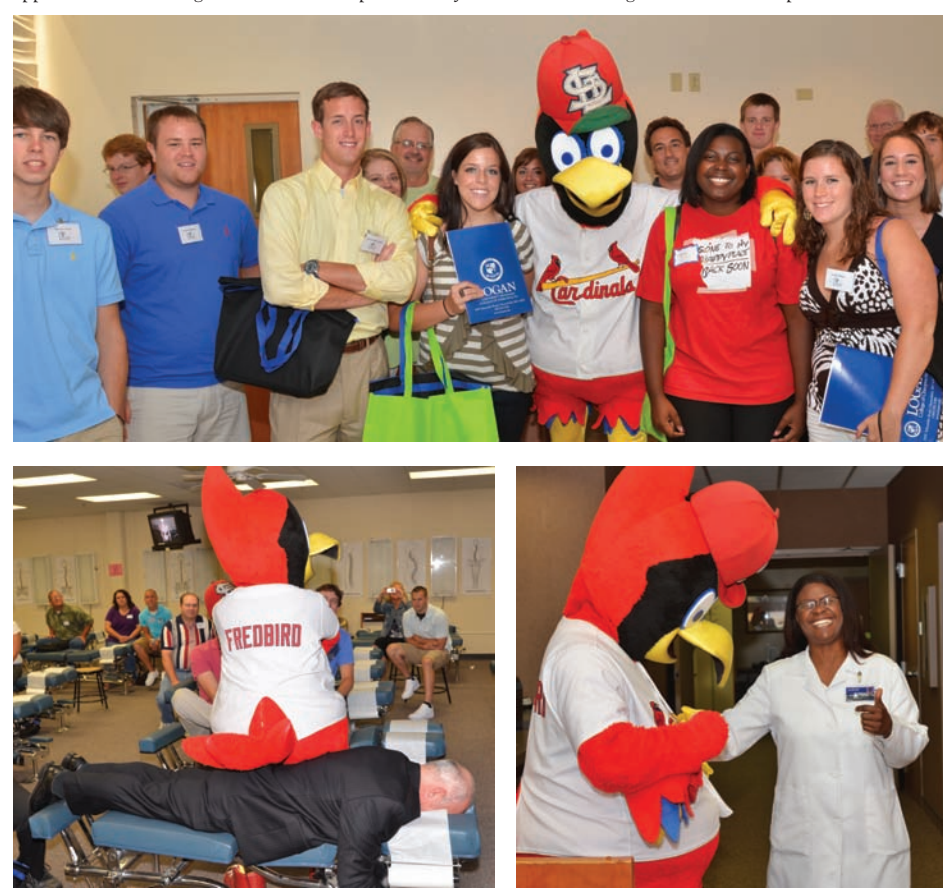
20 LOGAN COLLEGE OF CHIROPRACTIC/UNIVERSITY PROGRAMS

"Fredbird," the official mascot for the St. Louis Cardinals baseball club, made a special appearance at the Logan Admissions Department's June 25 "Slice of Logan" event on campus.