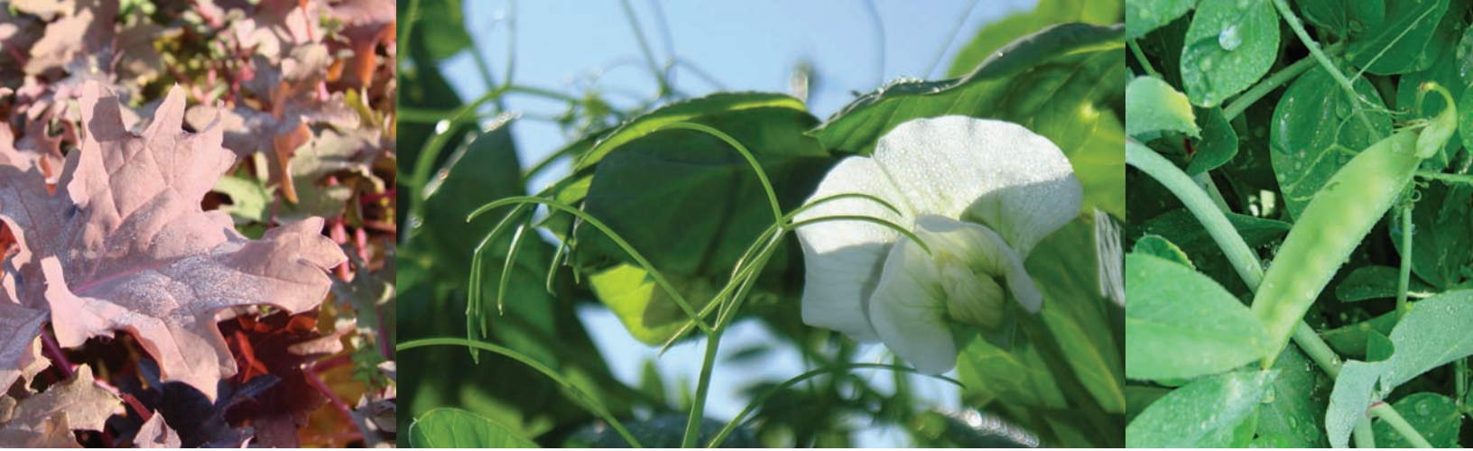
Above (from left to right): Red Ursa Kale, Sweet Pea Blossom and Sweet Pea Pod

"The biggest misconception I hear is that science is not a factor in organic farming, when in reality, Standard Process regularly uses GPS and conducts tests every five acres to determine soil conditions," she said. "We also employ a department of research and development that determines when vegetables have reached the optimal time for harvesting so we can maximize vital nutrient content."