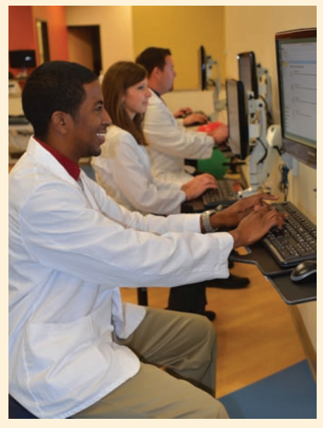
Logan senior interns work at the new Southfield Health Center

The center includes 14 patient treatment rooms, an intake room, two laser treatment rooms, and a physical therapeutic area. In addition, there is space for X-rays, ultrasound, and a full-service laboratory for blood draws. The center also features a BIOFREEZE® Sports & Rehabilitation Center, the first such satellite center to be located off of Logan's Chesterfield campus.